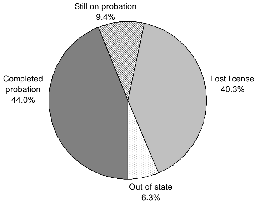
Chart 2. Outcomes of Probation for Chemical Dependency Probationers

Of the 89 chemical dependency probationers that did not complete probation, 66.3% failed the chemical dependency requirements, 38.2% failed the reports component, and 34.8% failed the mental health evaluation and treatment requirements of their probation, as shown in Table 11. Since almost all nurses with chemical dependency requirements of their probation were on probation for a drug or misconduct offense (93.3%), the reasons why these RNs failed probation are not categorized by the grounds for probation.